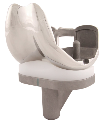
Figure 1 The Freedom® Total Knee System (PS)

Between November 2010 and December 2013, 176 consecutive primary TKAs were performed in 172 patients, without selection, utilizing the posterior stabilized (PS) Freedom Total Knee® system. All patients were followed at 2, 5, and 10 years. (1-3) At 10-years, two patients had early wound infection (I&D), one tibia revised post MVA, three patients died and ten were lost to follow-up. Of those patients original remaining for review, all had clinical and radiographic good to excellent outcomes achieving the goals of relief of pain, restoration of function and maintenance of a durable prosthetic composite.