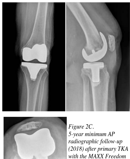
Figure 2C. 5-year minimum AP radiographic follow-up (2018) after primary TKA with the MAXX Freedom Knee System.