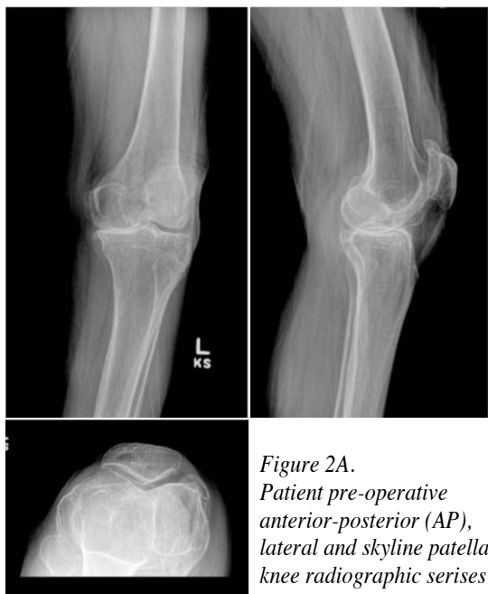
Figure 2A. Patient pre-operative anterior-posterior (AP), lateral and skyline patellar knee radiographic series (2012).